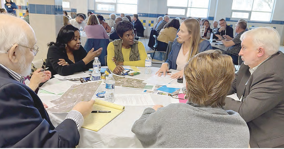
Facilitators and scribes record points of discussion on a series of questions related to the land reuse and community needs

Currently located at 6121 Franconia Road, Alexandria, the "Proposed One-Year Action Plan for Country FY-2024" lists the Franconia Government Center project. The