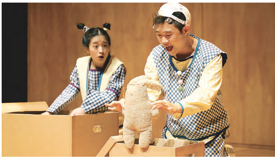
The BRUSH Theatre presents "POLI POP" on Sunday, April 21, 2024 at the McLean Community Center in McLean.

543 Beulah Road, N.E., Vienna. Enjoy creative floral designs presented by club members as well as horticultural specimens on display from member home gardens. Free and open to the public.