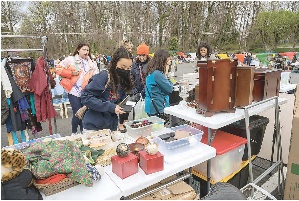
The Spring Community Parking Lot Sale will take place Saturday, April 20, 2024 at the McLean Community Center in McLean.