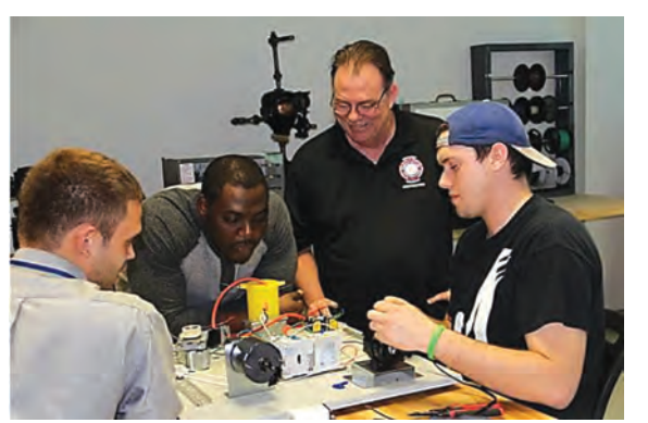
Equal Opportunity M/F

For additional information scan the QR Code.