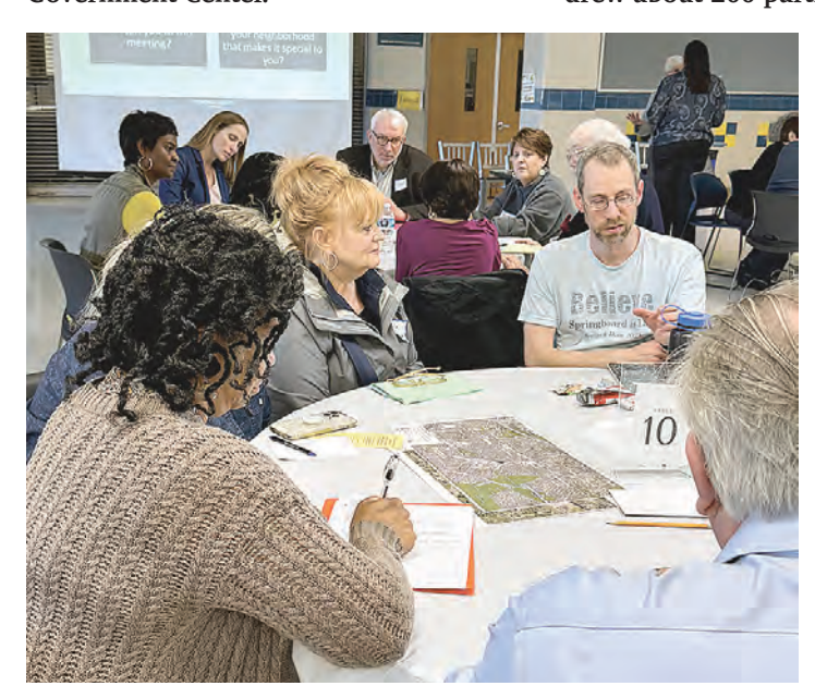
Those attending were asked to share their thoughts and interests in the Franconia Government Center reuse project