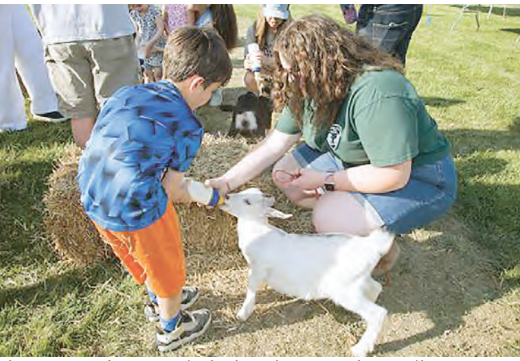
The 2024 Earth Day Festival takes place Saturday, April 20, 2024 at Sully Historic Site in Chantilly.

Centre Ridge North Park, Centreville (9-11:30 a.m.) Merrybrook Run Stream Valley Park,